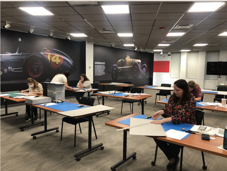
Box making workshop at the Indianapolis Motor Speedway Museum.

At the AMM 2023 conference, the Indianapolis Motor Speedway Museum hosted a workshop on custom-box building. Attendees used their measuring, cutting, and math skills to create custom artifact storage boxes. Attendees even got a behind-the-scenes tour of the various storage areas at the Museum. The Museum is currently embarking on a capital campaign that will include improved collection storage spaces to ensure the collection is preserved for years to come.