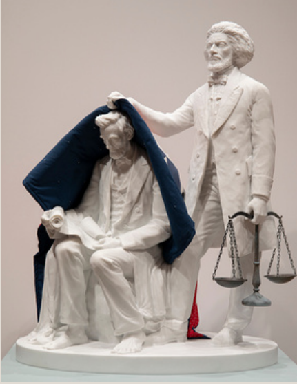
Left - Sanford Biggers, Lifting the Veil, 2023, marble, antique quilt, mixed media

New Acquisition: Lifting the Veil by Sanford Biggers