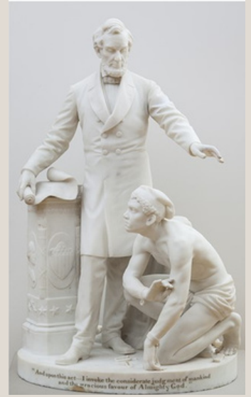
Right - Thomas Ball, Emancipation Group, 1873, marble

When artist Sanford Biggers visited the Chazen Museum of Art at the University of Wisconsin–Madison in 2019, he had a jarring encounter with Thomas Ball’s Emancipation Group (1873), a four-foot marble sculpture that sat atop a pedestal in the gallery. Although familiar to Biggers, the depiction of an impeccably dressed Abraham Lincoln heroically towering over a partially-clothed freedman incited a visceral reaction that day. His response to that moment instigated the subsequent two years of the re:manicipation project which includes a new sculpture, Lifting the Veil, that strips Lincoln of his saviorhood and turns it over to Frederick Douglass, a freedman, abolitionist, author and public figure who had a complex relationship with the president.