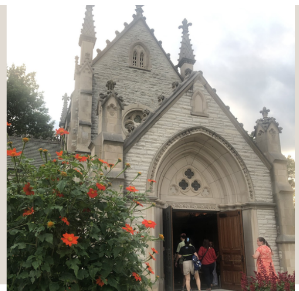
Right - Opening night at Crown Hill Cemetery