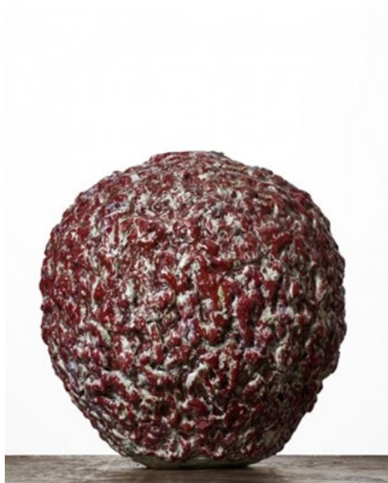
Morten Løbner Espersen: Blood Moon

Two contemporary Danish ceramicists will be the feature of the next art installation at the Museum of Danish America. Though their styles are uniquely their own, both Geertsen and Espersen play with traditional vessel forms and push them up to – sometimes over – the edge.