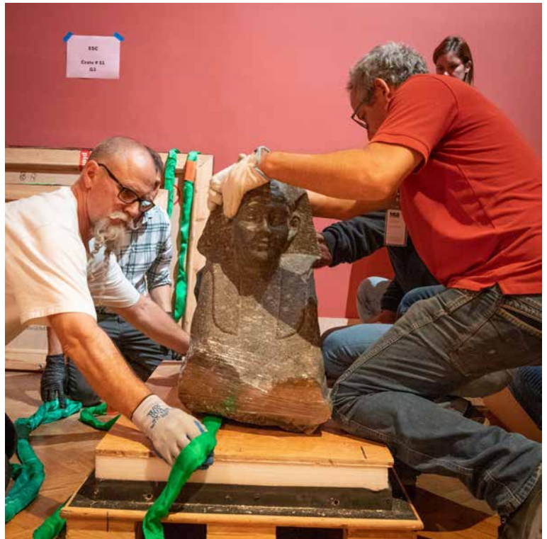
Installation of Egypt's Sunken Cities

The objects featured, which include jewelry, ceramics, sculpture, architectural details, and three 16-foot-tall colossi, were excavated a mere two decades ago by Franck Goddio and his team in the Mediterranean Sea, where they had been lost for more than 1200 years. Most of the objects were excavated at one of two sites, two ancient cities that were lost to the Mediterranean due to natural disaster and rising sea levels: Canopus and Thonis-Heracleion.