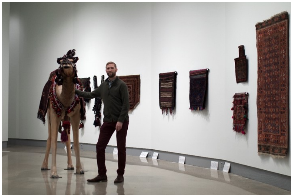
Hanging out with the gallery camel