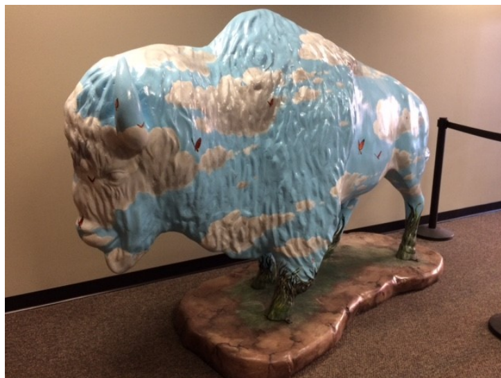
A fiberglass Bison, part of Indiana's Bison-ennial Public Art Project

Happy Birthday Indiana!!! December 11, 1816