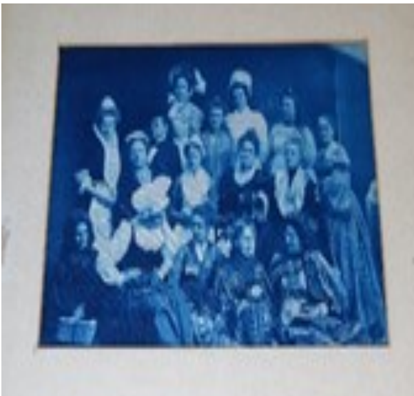
Items from the East Tawas Ladies Literary Club Collection