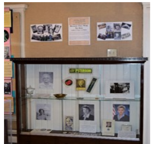
Because They Won, We Run: Michigan Women in Politics