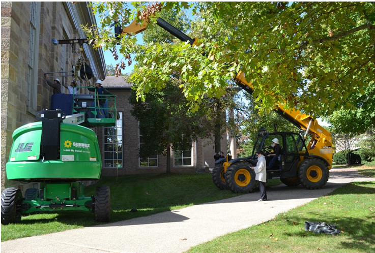
Installation of Pore

The sculpture joins several other artworks on campus as part of an active public art program. Other noted artists on view include Henry Moore, Kiki Smith, Paul Manship and Louise Nevelson.