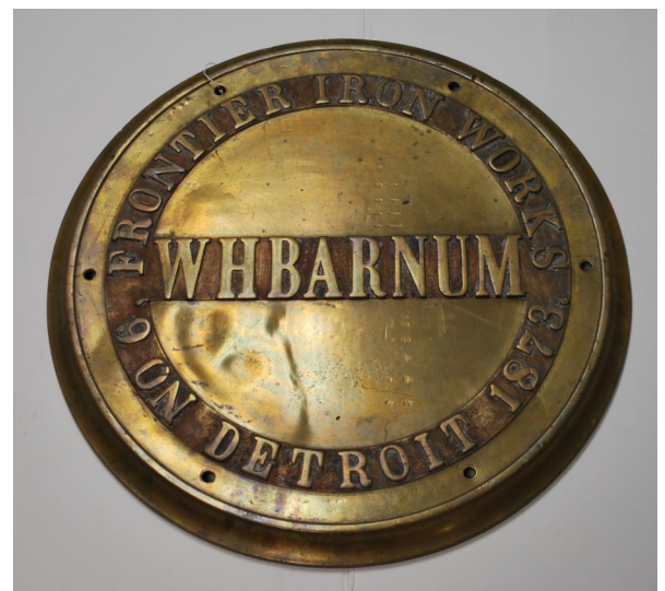
Brass engine plate from the steamer William Barnum

Mackinac State Historic Parks recently issued a request for proposal for the conservation of two recent collections acquisitions. Two different donors gave a brass engine