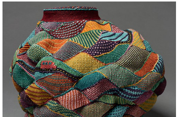
Basketry from the Rooted, Revived, Reinvented: Basketry in America exhibition, L-R: Ed Rossbach, Mickey Mouse Coil Basket , 1975, Synthetic raffia, sea grass: 6" x 9" x 9" ; Lois Russell, Magic Bus , 2012, Waxed linen: 9.25" x 11.5" x 10.5"