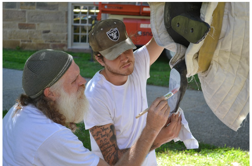
Preparing Pore for installation

In October, the Gund Gallery, installed Pore , by noted sculptor Antony Gormley, on the North façade of Rosse Hall. The anthropomorphic work, showing a figure seemingly crouched on the side of the building, was an uncanny sight that surprised and delighted students upon their return to campus over fall break.