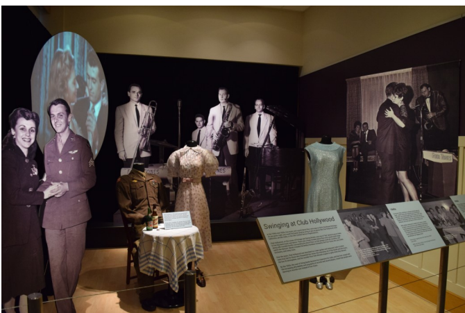
TOP: Club Hollywood

The exhibit was designed and produced by the Kalamazoo Valley Museum and made possible with a grant from the Kalamazoo Valley Community College Foundation . The exhibit is open through January 16, 2017.