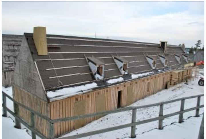
South Southwest Rowhouse, Colonial Michilimackinac

One of the features integrated into the exhibit space is an original French fireplace. It was covered over by a sand dune and preserved until excavated in the 1960's. It is the only original above ground feature remaining of Fort Michilimackinac.