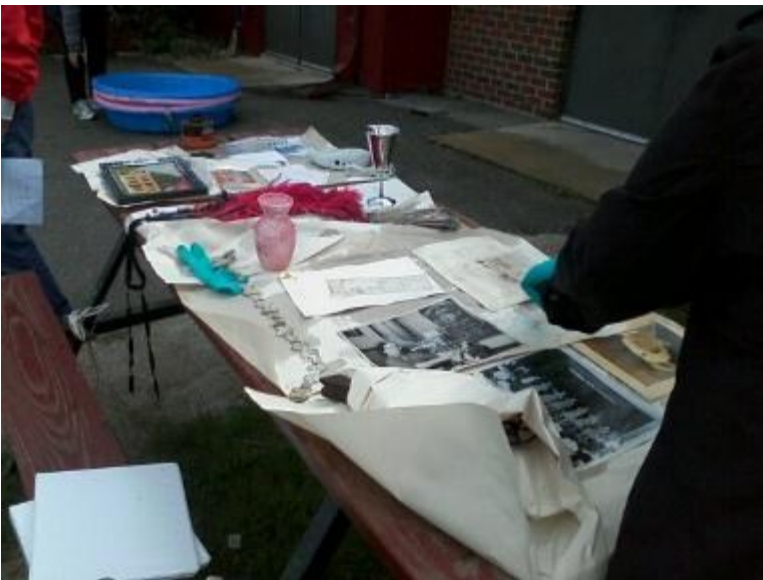
More of the recovered objects

It seems wrong to say that we had fun; disasters are very serious business after all. But since it was only a mock disaster, I guess it is OK. We really did have fun; learning together, laughing at our mistakes and rewarding each other for our accomplishments. I am glad to know that there are trained professionals among my BCFHM colleagues who will help out if needed and I am glad to know that September is National Preparedness Month.