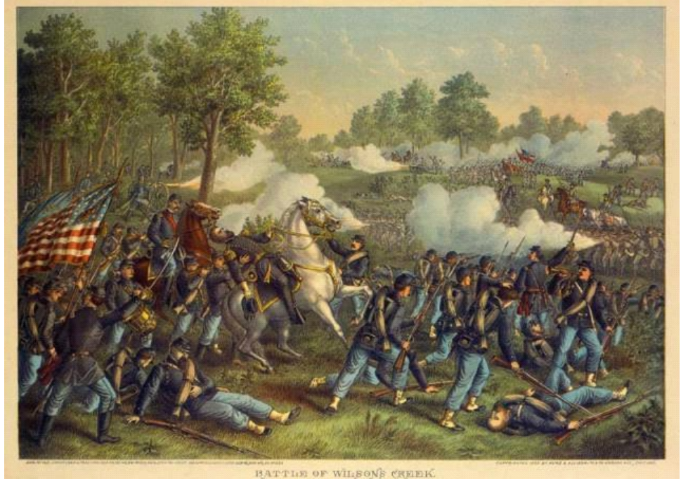
Battle of Wilson's Creek. (Missouri, 10 August 1861.) Chromolithograph by Kurz and Allison, 1893.

Missouri may best reflect the Civil War's rending of our nation. Prior to the Civil War, the state was bitterly divided between pro-slavery secessionists and those determined to preserve the Union. The Missouri Compromise, the Dred Scott Case, and the Missouri-Kansas border conflicts exposed the simmering tensions. Claimed by both the Union and the Confederacy, two state governments grappled for control of Missouri. Today, Missouri and its role in the Civil War continue to generate controversy among historians, academics and Civil War enthusiasts. The Civil War in Missouri features compelling artifacts, imagery and interactive elements. Although the exhibition addresses issues with which our entire nation wrestled, topics that are distinctively Missourian take center stage.