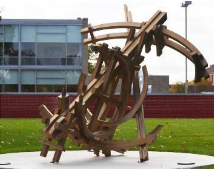
Michael Dunbar, American, born 1947. Orbits of Isaac , bronze, 2011, 138 x 144 x 168 inches, Courtesy of the artist. Photo: Flint Institute of Arts.

Additionally, an exhibition of 10 smaller sculptures by Dunbar were installed in the FIA Contemporary Gallery. These smaller works, created by Dunbar as studies for larger sculptures, were on display from November 11 to December 16, 2012.