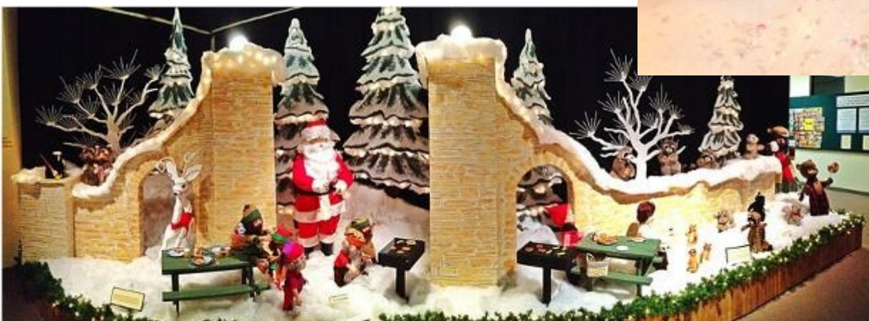
Holiday animation in a replica of Evergreen Park and a happy raccoon eating a "brat" - all part of Holiday Memories 2012