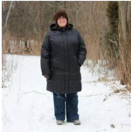
A winter walk at the Schlitz Audubon Nature Center — Routine walk in a change of venue

Every year around this time, I go into what is commonly referred to at our house as routine frenzy—a strange combination of cleaning, organizing, purging, and general attempts to get into some sort of “normalcy.” I can give a thousand philosophical reasons why it might be. Perhaps the influence of the whole New Year’s Resolution? (Keep in mind, I am not a resolution person... but that is another philosophical discussion!) Maybe it is a result of the crazy schedule of November and December that often results in me not knowing what day of the week it is. Could it be an aftereffect of copious amounts of glitter - a major part of my life during our holiday exhibit, a collection manager (and custodians) nightmare and a reality of life well beyond the end of our Holiday Memories exhibit. Or is it just a natural transition, much like the process of having to remember to put 2013 on all the